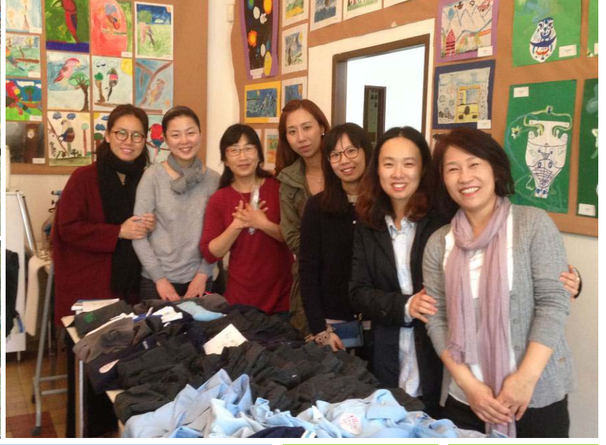
A brief introduction to parents at BISC Wrocław