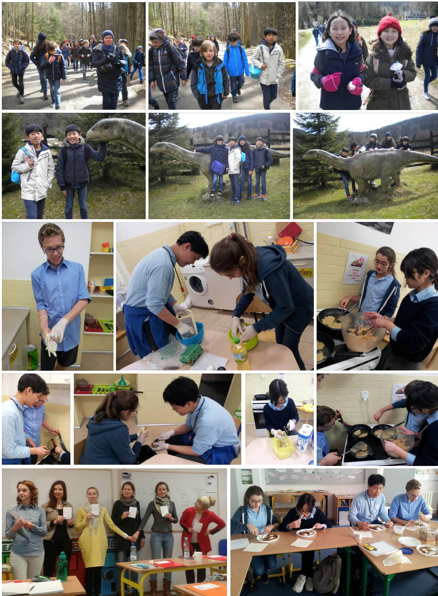
A brief introduction to parents at BISC Wrocław