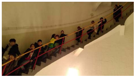
A brief introduction to parents at BISC Wrocław