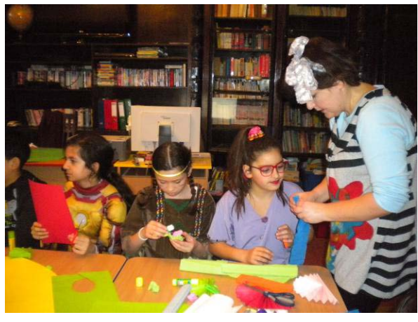
A brief introduction to parents at BISC Wrocław