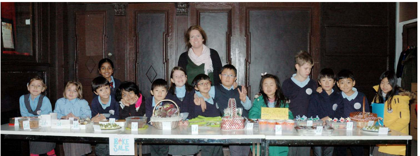
A brief introduction to parents at BISC Wrocław