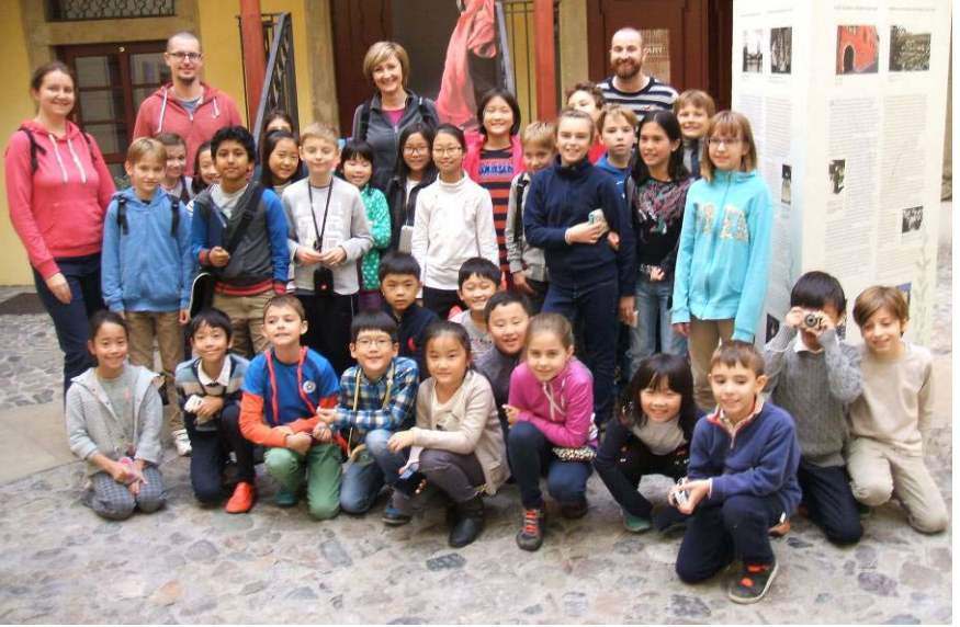
A brief introduction to parents at BISC Wrocław